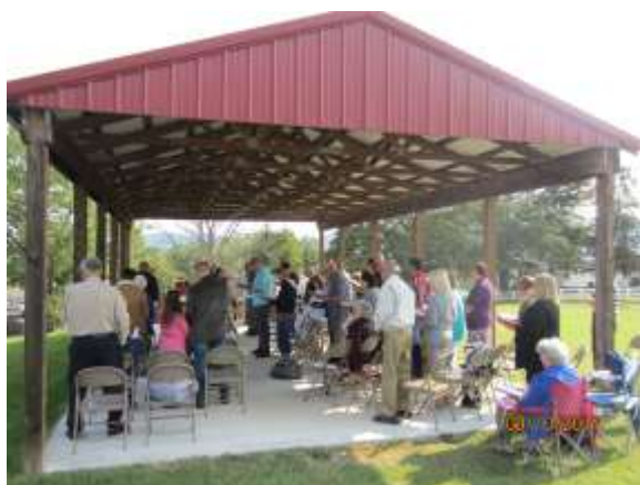
Rally Sunday – Sept. 10, 2017 Outdoor worship followed by an indoor luncheon.