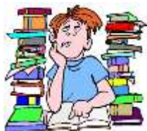
Exam Cram Bags Mission

We appreciate not only the content of the bags but also the time that members of your congregation put into preparing them for our students to enjoy. It was an act of love, and we are grateful.